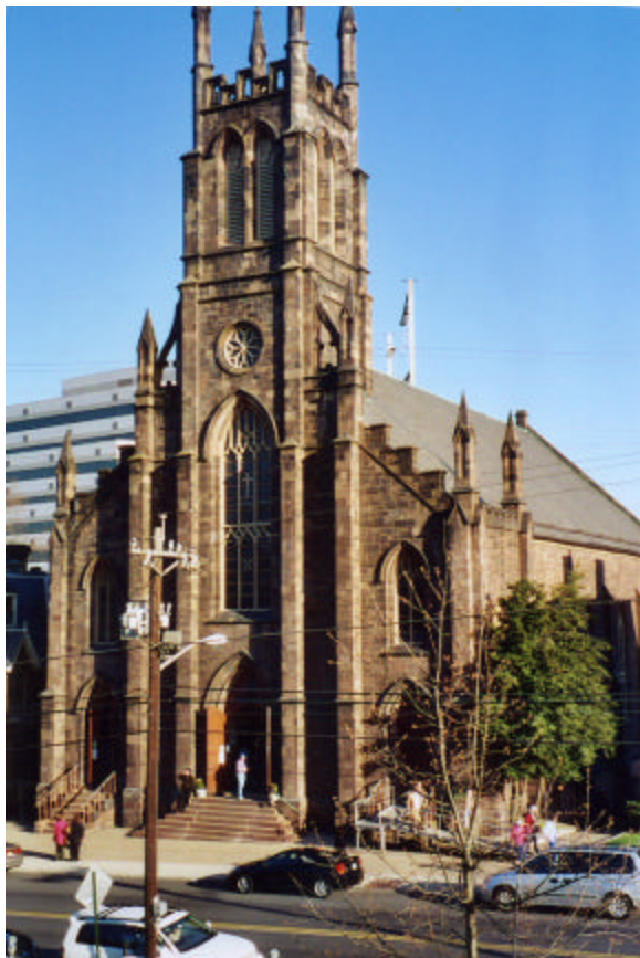
St. Peter the Apostle R.C. Church, New Brunswick